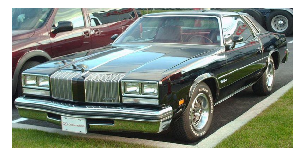
1977 Oldsmobile Cutlass

Years later in the USA Salvation Army National Archives I read the correspondence between a Territorial Commander and a Lieutenant who was threatened with dismissal and was eventually sacked because he wouldn't dispose of his Oldsmobile (I think it was), deemed not to be a "Lieutenant's car". I kid you not. (Perhaps there was another back-story.)