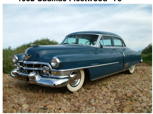
1952 Cadillac Fleetwood "75"

He replied, "Oh, no, not at all. Where I come from [USA Western territory], this is a Lieutenant's car. Commissioners drive Cadillacs !"